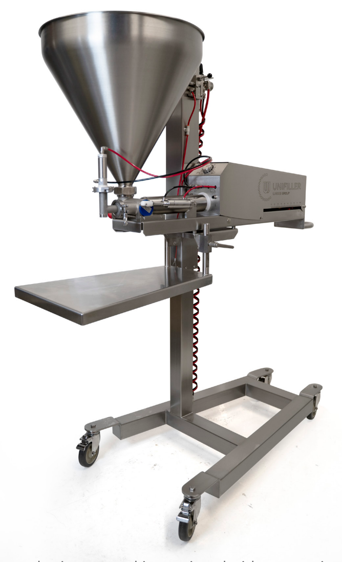
Example picture; machine equipped with accessories