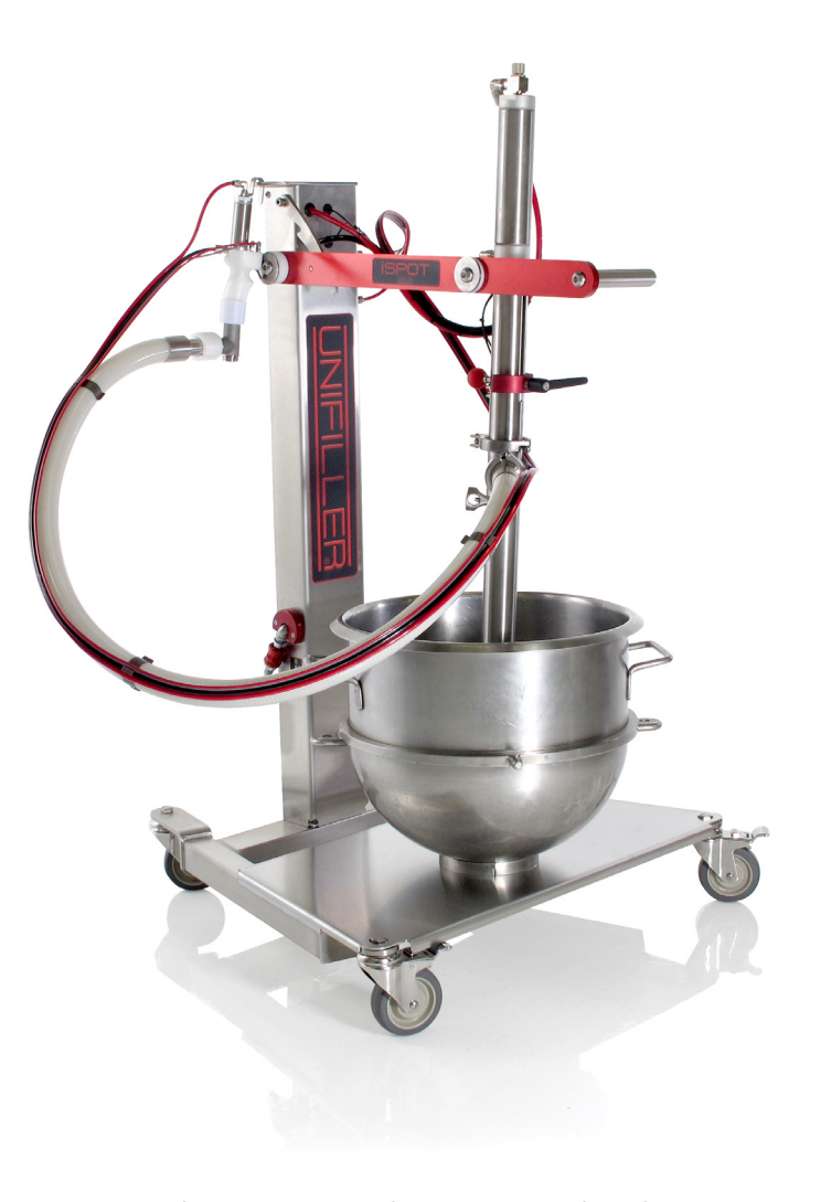
Example picture; machine equipped with accessories

With its user-friendly, easy to use design, this versatile machine allows you to draw and deposit smooth products directly from a bowl or pail. The iSpot Depositor can be fitted with several Unifiller attachments to create perfectly looking single-serve desserts or even be used for spraying syrup or as a mini transfer pump to fill your hoppers.